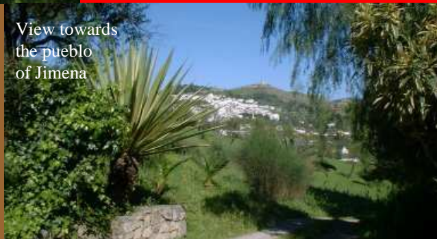
View towards the pueblo of Jimena

We are also fortunate in having a charming Spanish couple living in the next door cottage, who will be only too happy to answer your questions about the region.