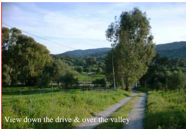
View down the drive & over the valley

This house was the home of an artist and her husband who were one of the first Northern Europeans to settle in this lovely “white village” in the heart of Andalusia. The house’s location was chosen for the quality of light that it enjoys, as well as the stunning views over the valley beneath.